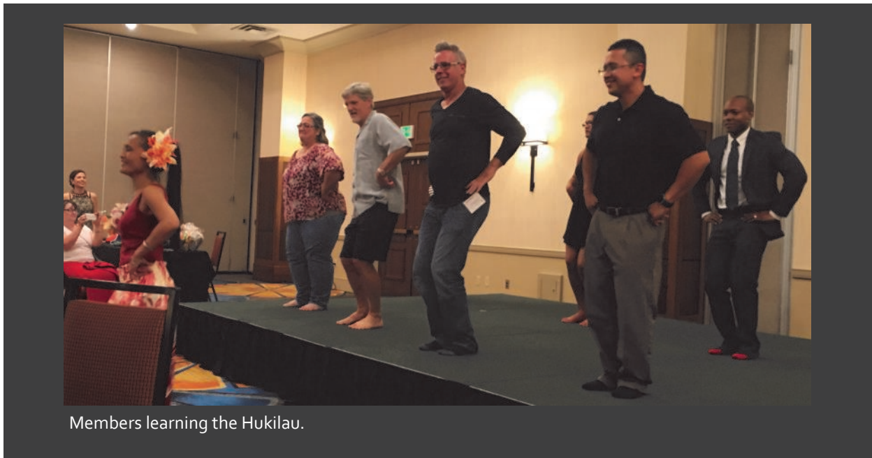
Members learning the Hukilau.