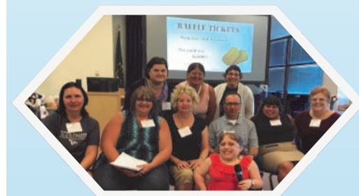
2015-16 STTACC Board