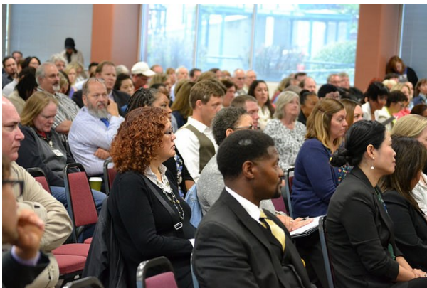
Opening Day Crowd

Faculty and staff were excited and ready to welcome students to the first day of fall quarter, Sept. 25.