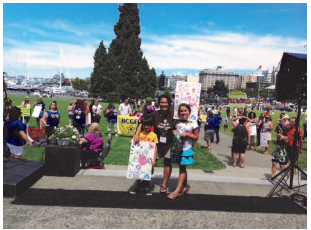
SIUW Conference Attendee

The Western Regional Summer Institute for Union Women (SIUW) offered an intensive week of learning within a supportive environment in which union women could develop their skills as workers, activists and leaders. It was hosted by the British Columbia Federation of Labour.