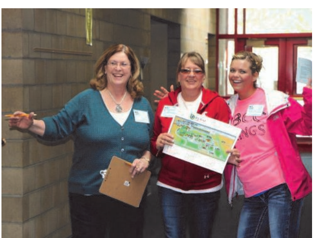
Pink Team Wins Scavenger Hunt!